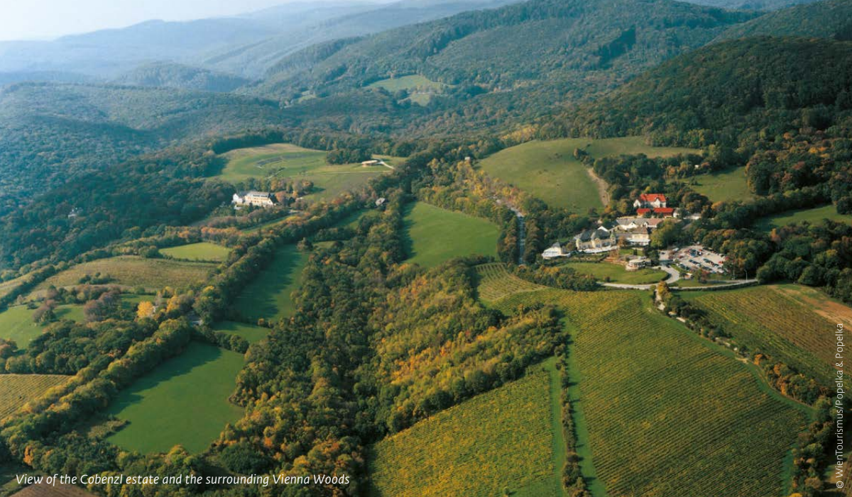
View of the Cabenzl estate and the surrounding Vienna Woods