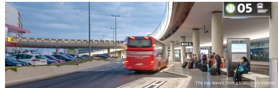
The bus leaves from 3 stations in Vienna

In Check-In 1, open daily from 07:00 – 19:00 hrs.