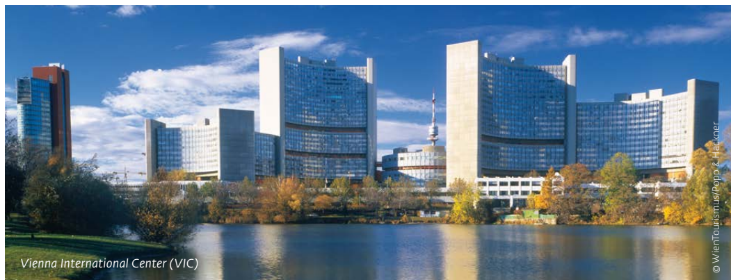
Vienna International Center (VIC)

You haven't been to Vienna if you didn't visit a coffeehouse. There you might meet one of the many congress participants as Vienna is host for more than 3,300 conferences each year.