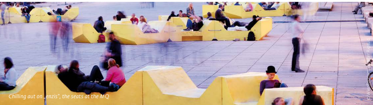
Chilling out on „enzis“, the seats at the MQ

Vienna is young, fresh and one step ahead in terms of culture.