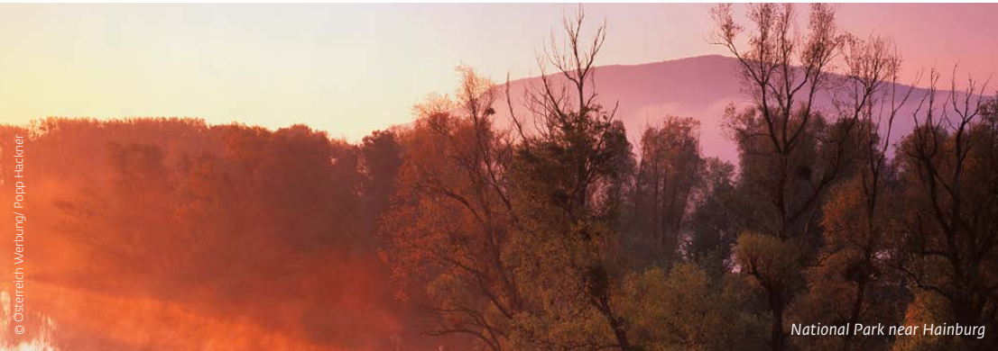
National Park near Hainburg

Vienna has it all: the beautiful location offers diverse opportunities for excursions.