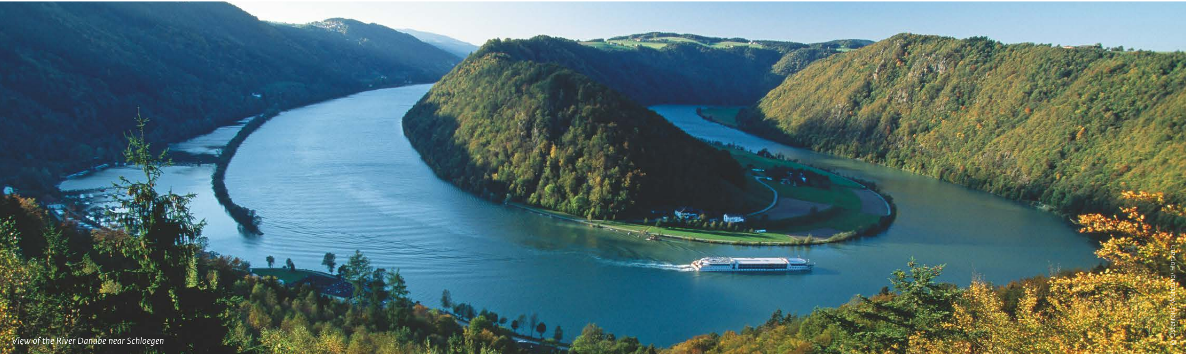
View of the River Danube near Schloegen

Area: 414km 2 Districts: 23 Population: 1.7 million Sea level: 171 m Language: German Currency: EURO