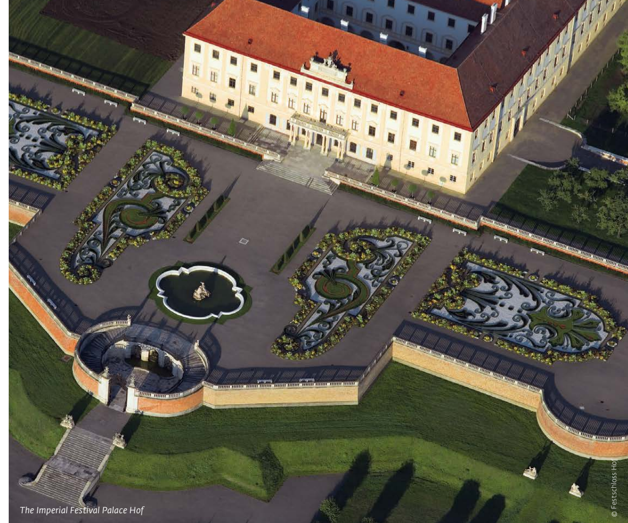
The Imperial Festival Palace Hof