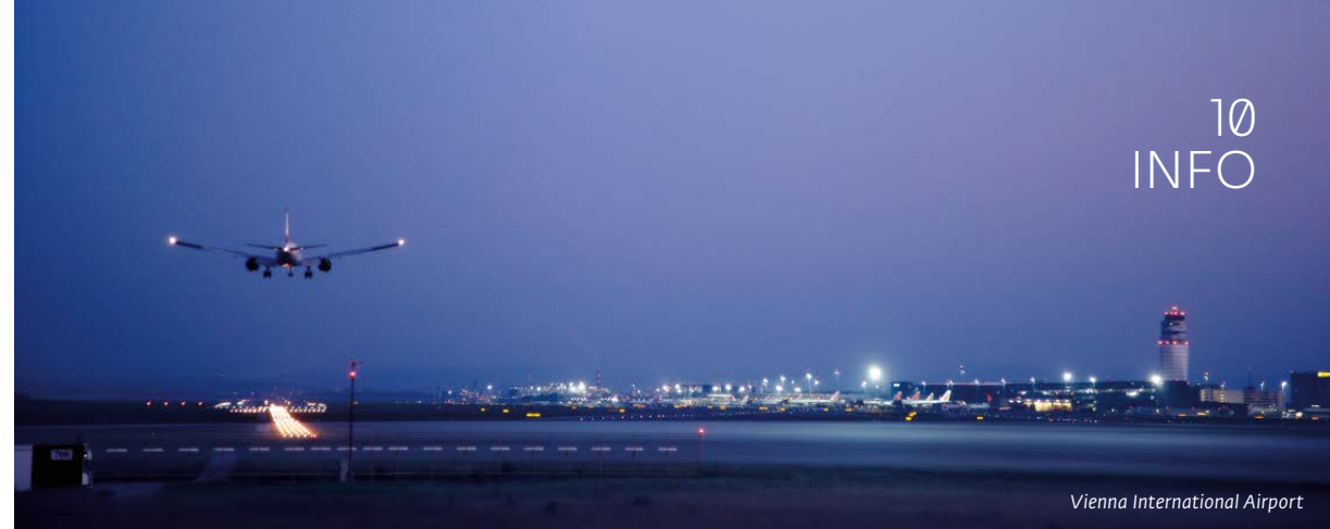
Vienna International Airport

Fare: from € 4.00 (incl. journeys on entire Vienna Transport Authority network)