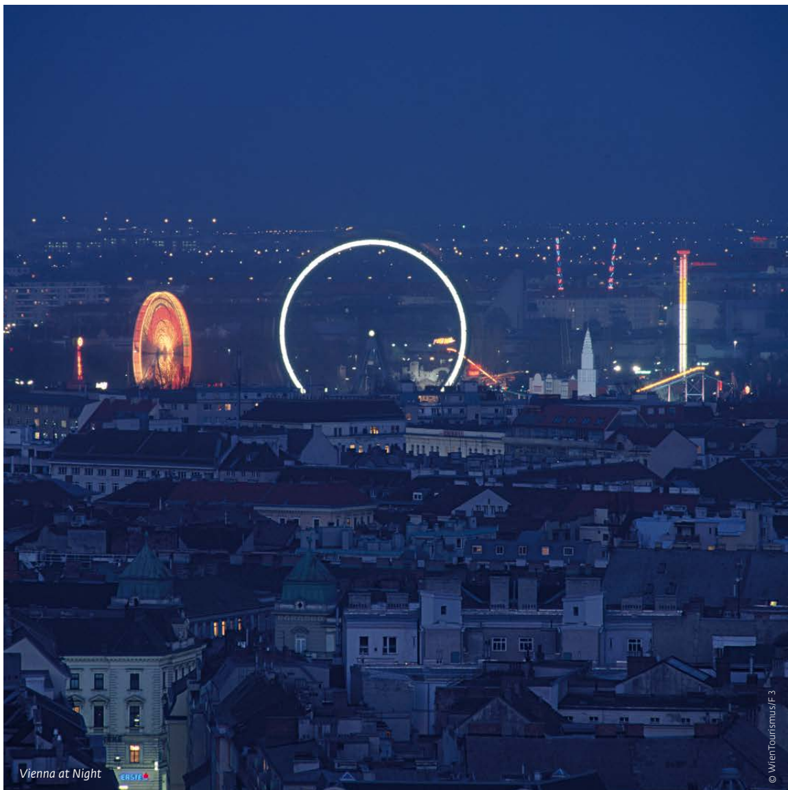
Vienna at Night

Albertinaplatz (corner of Maysedergasse) 1010 Vienna Phone: +43-1-24-555 Email: info@wien.info www.wien.info