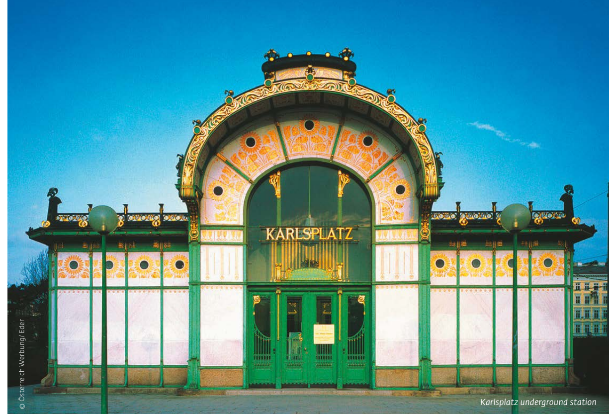
Karlsplatz underground station

www.global-blue.com www.taxfreeworldwide.com