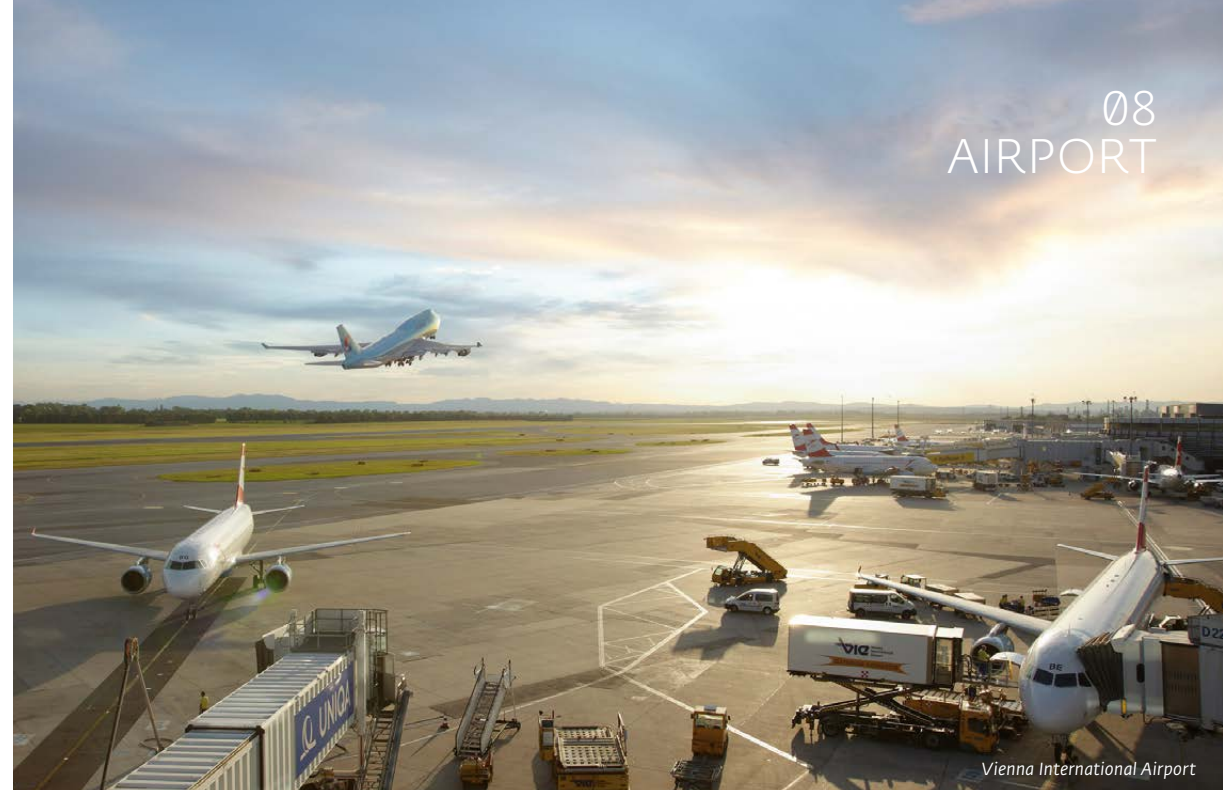
Vienna International Airport